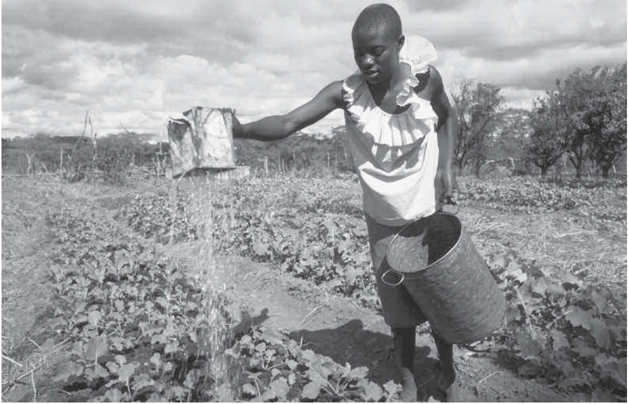
Member of a women's group waters their cabbage, Zimbabwe